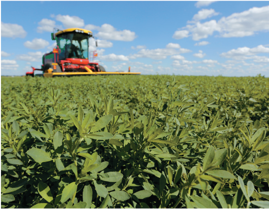
Stockpile's dense persistent stands make it a forage yield leader.