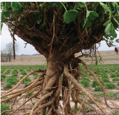
The branch root of 4010 BR gives superior performance in wet soils