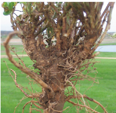
3010 has a sunken crown root characteristic for increased traffic tolerance